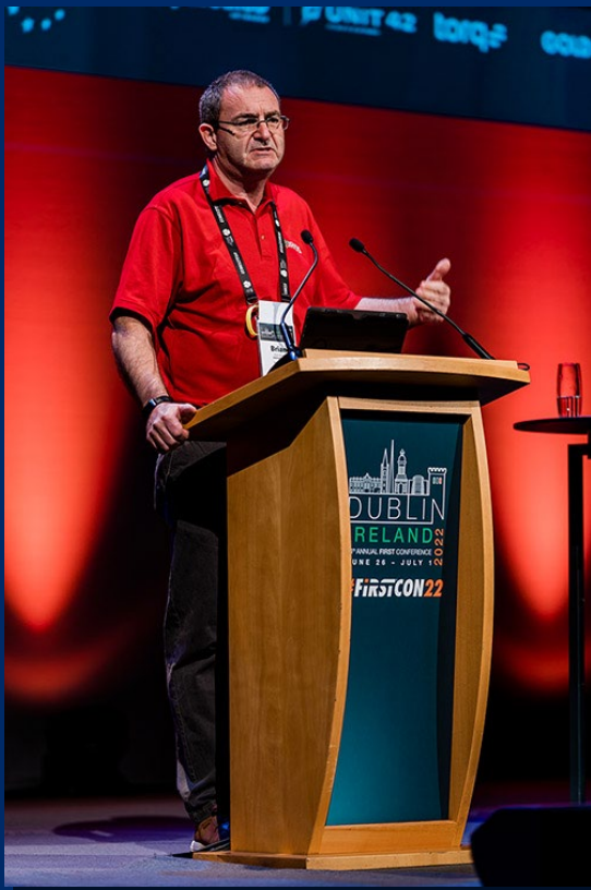
Photo Gallery Annual FIRST Conference, Dublin